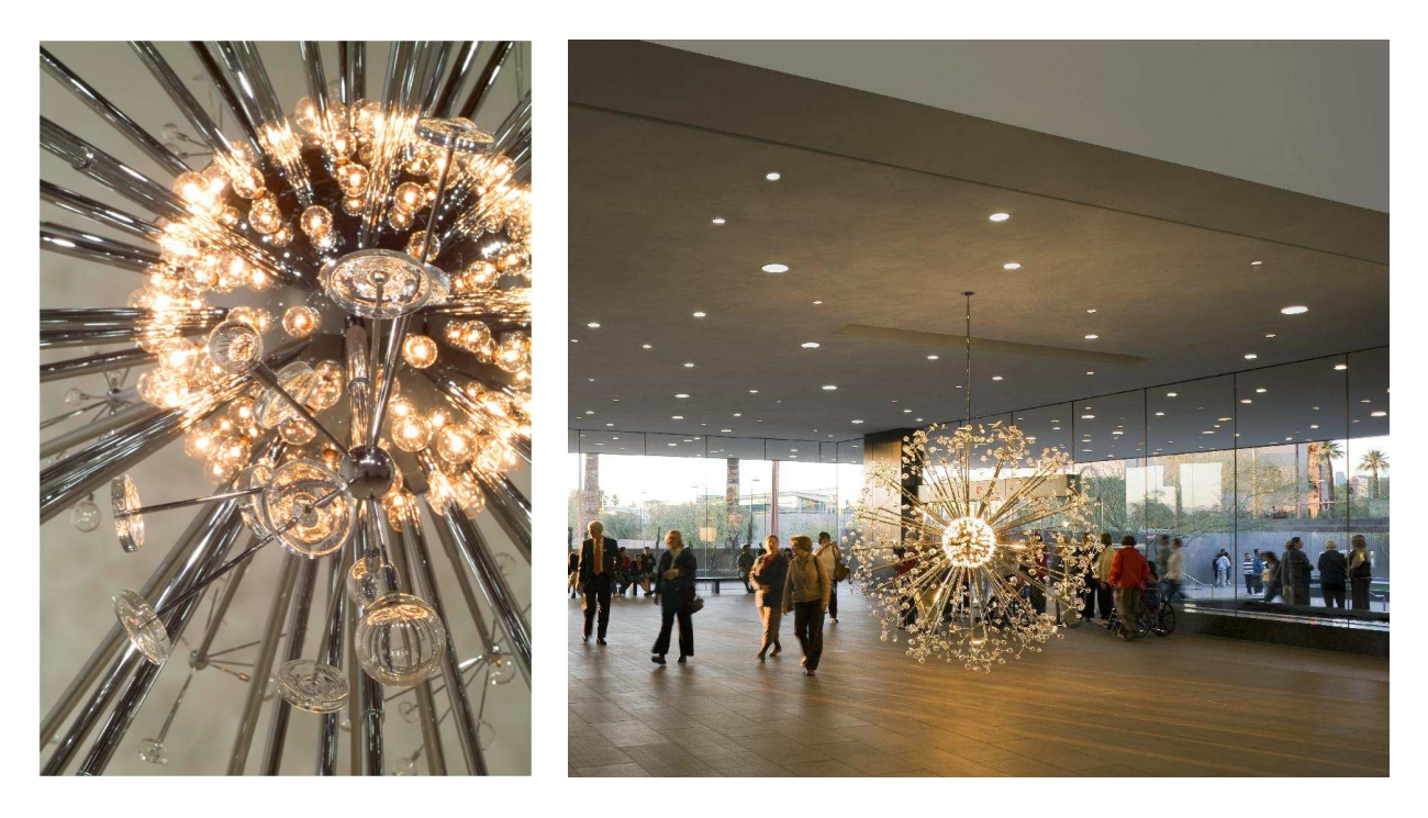
The Last Scattering Surface (Josiah McElheny, 2006) exhibited at the Donald Young Gallery in Chicago (left, detail) and in its permanent installation at the Phoenix Art Museum (right). Dimensions are 88" \times 88" . Images courtesy of J. McElheny.