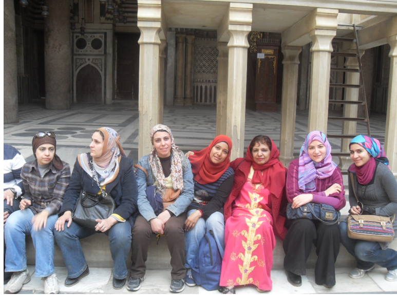
L: Zewail City of Science & Technology in Egypt after my presentation, ISMWS members at historic Al-Azhar in Cairo