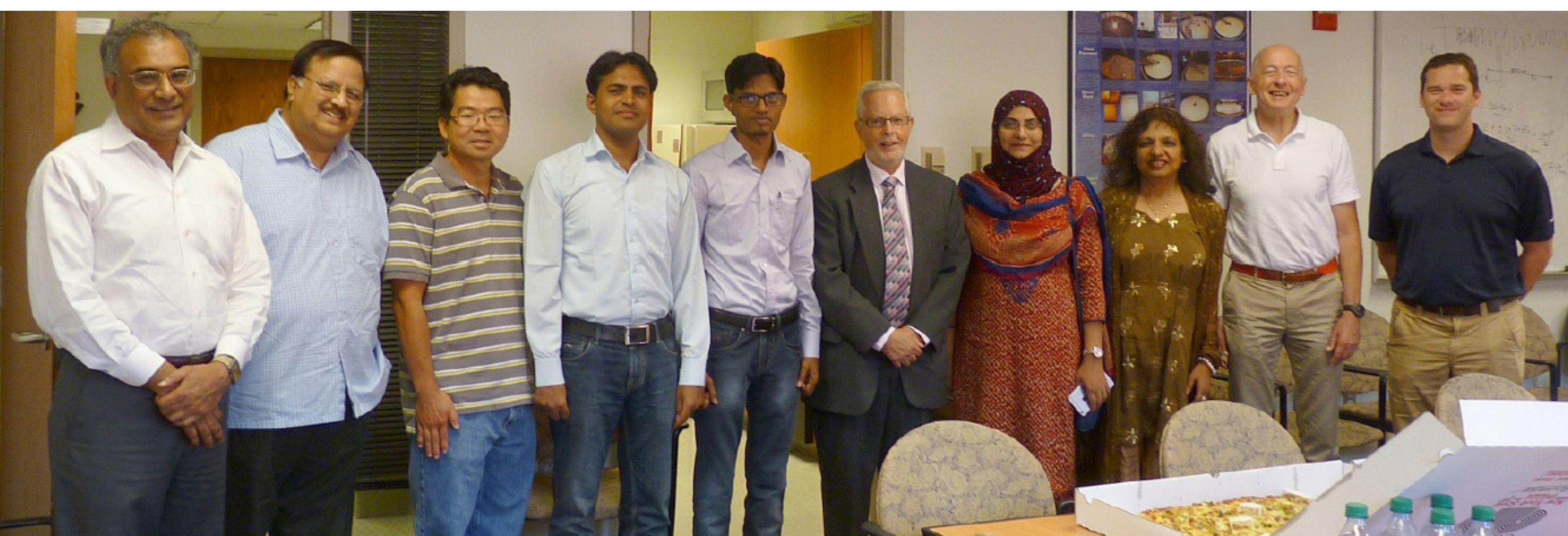
Reception of second batch of students with advisors and OSU officials, August 2016