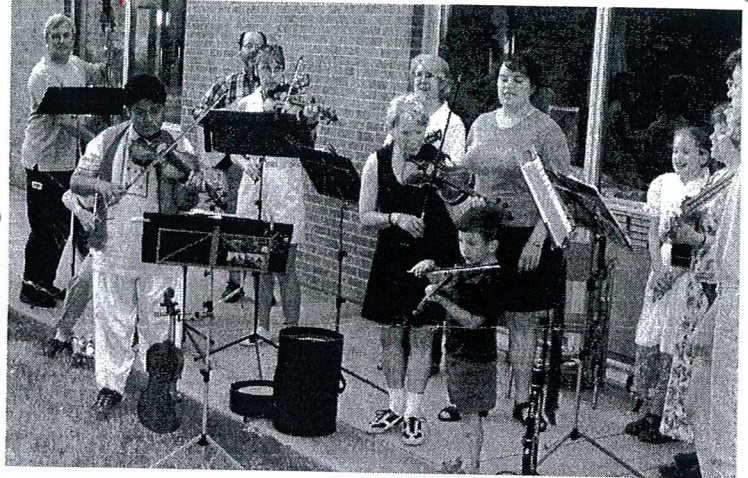
Above: Mixed Bag plays outside.