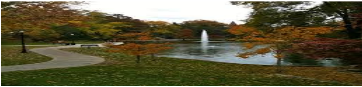
OSU Mirror lake