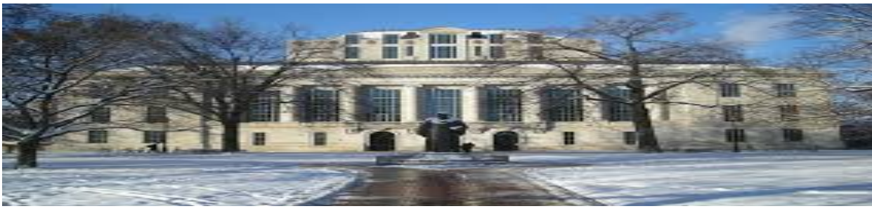
OSU Thompson library