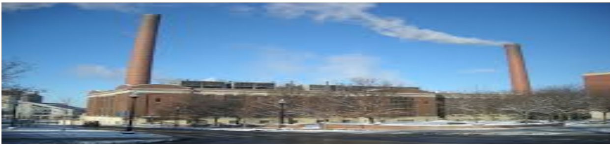
OSU Power plant