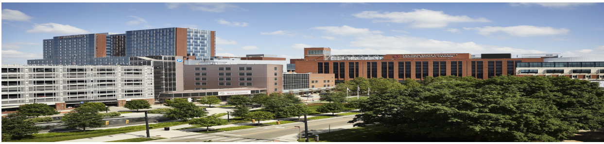
OSU Medical Center

iii) Teaching Assistantship (TA, needs some communication skill). It may involve in helping in undergraduate courses (computer grading, proctoring exams, office hours for students) - a helpful option for teaching experience