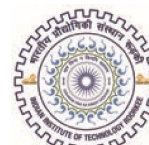
Indian Institute of Technology Roorkee