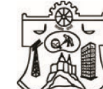
National Institute of Technology Tiruchirappalli