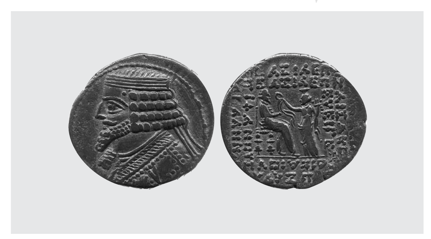
Iranian coins from late antiquity

scholarly group -- do not yet have an academic venue in the US... [Thus,] the ASPS is hereby extending an invitation to the Association and its first rate journal, the Journal of Persianate Studies (JPS)... issue 5:2 of the Journal, guest edited by myself, will be devoted to 'Recent Trends in Late Antique Iranian Studies'..."