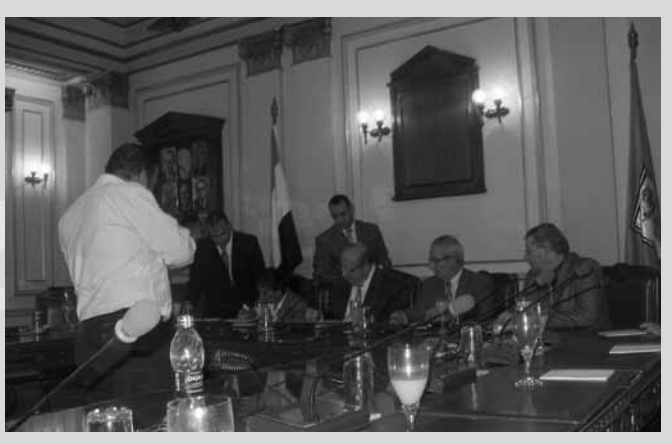
Signing of the Memorandum of Agreement (MOA) between The Ohio State University and Cairo University

the 4th UFLTA held both at Cairo University and in Luxor during April 8-12 and delivered an honorary keynote speech on x-ray laser application to cancer theranostics at UFLTA. Participants came from several universities and