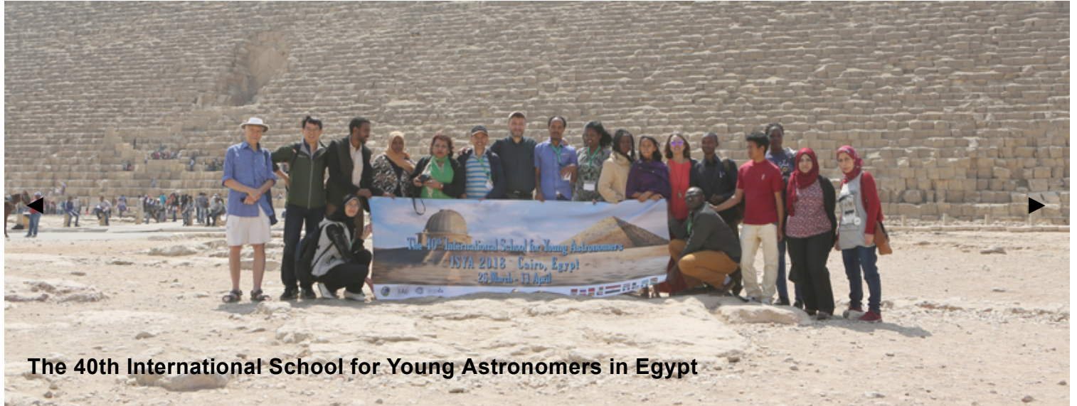
The 40th International School for Young Astronomers in Egypt